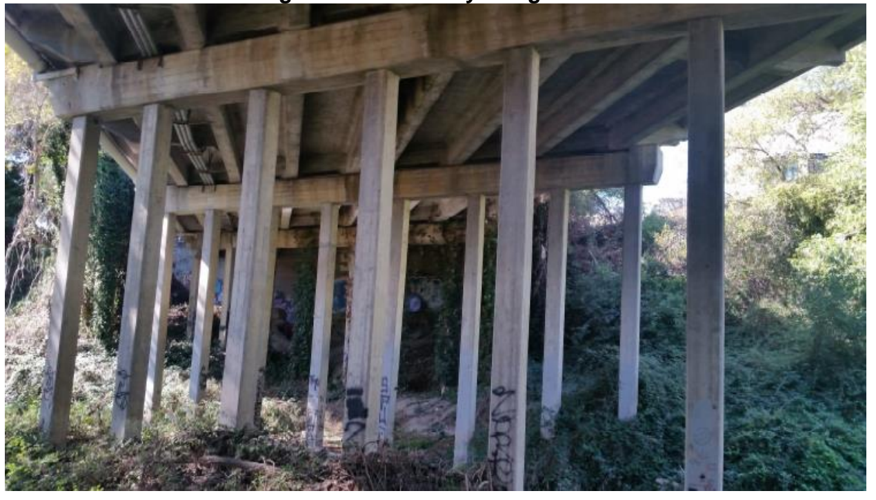
Figure 1: Traffic Way Bridge Piles

Traffic Way Bridge was first constructed over Arroyo Grande Creek in 1932. Its piles, which are concrete posts driven into the ground for support (see Figure 1), were originally embedded (set firmly into the ground) 23 feet into dirt.