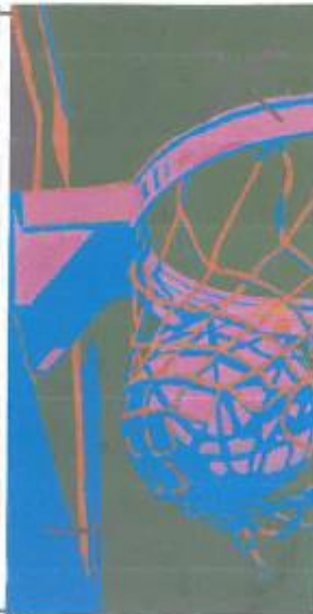
SIDE 24" W