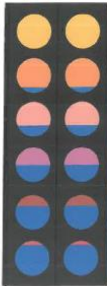
FRONT 33" W 65" H