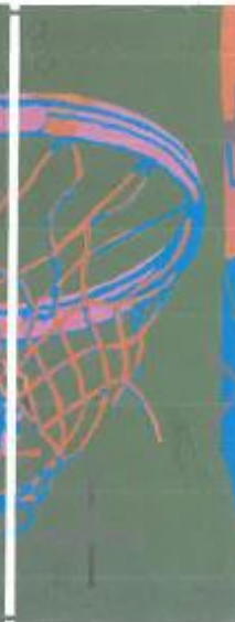
BACK 33" W