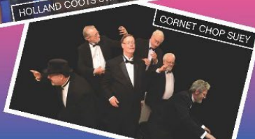
CORNET CHOP SUEY