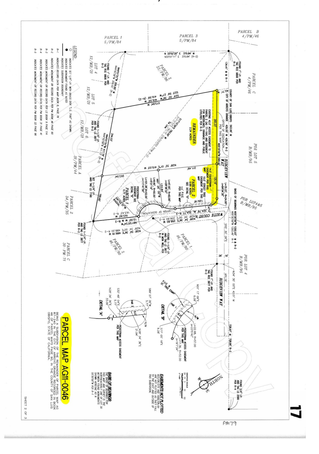
EXHIBIT "B" REMAINDER PARCEL & PARCEL 2, PARCEL MAP AG 11-0046