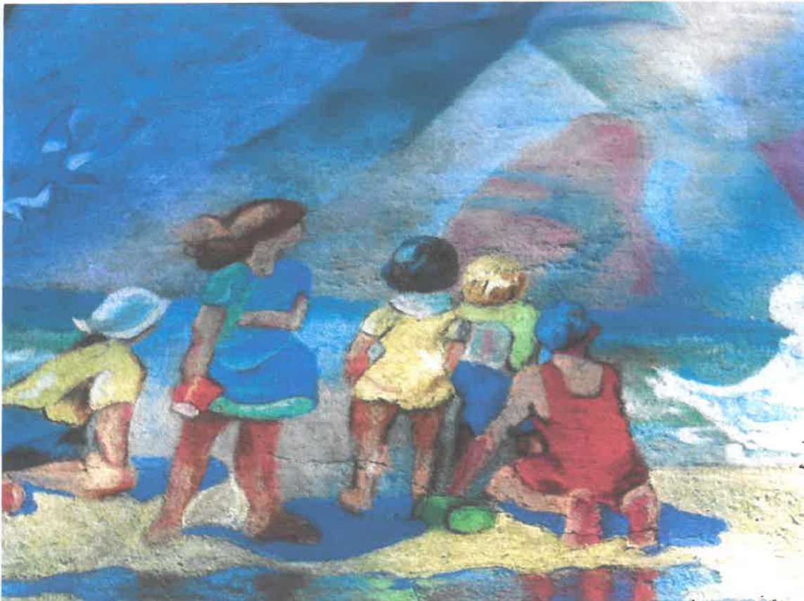
Chalk on Asphalt

I was selected to participate in the iMadonnari Street Chalk Festival in San Luis Obispo for 15 years.