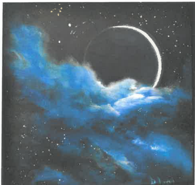
NEW MOON BLESSINGS 24" X 24"

INSPIRED BY THE PLAY OF LIGHT AND COLOR IN GARDENS...AND THE MANY VARIETIES OF POPPIES NATURE OFFERS.