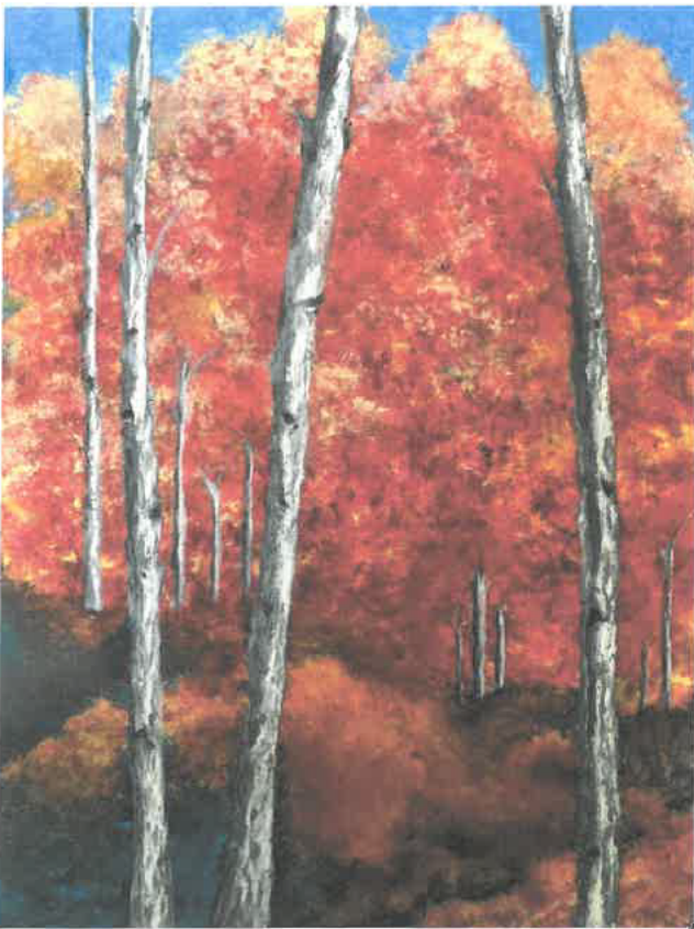
LOVING HER GLOW 24" X 18"

INSPIRED BY MY MEMORIES OF FALL COLOR AND EXPERIMENTING WITH TEXTURE