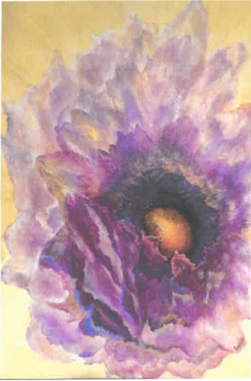
POPPY DEAR 30" X 20"