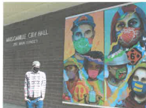
Artist name: Erik Davison Title: "Wear Together" Location: 250 Main St., Watsonville, Ca. Medium: digital Date work completed: 9/23/2020 Dimensions: 8' x 8'