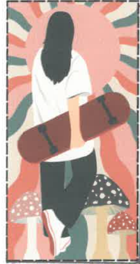
MOUNTED BOX 53"H, 22"W, 15"D