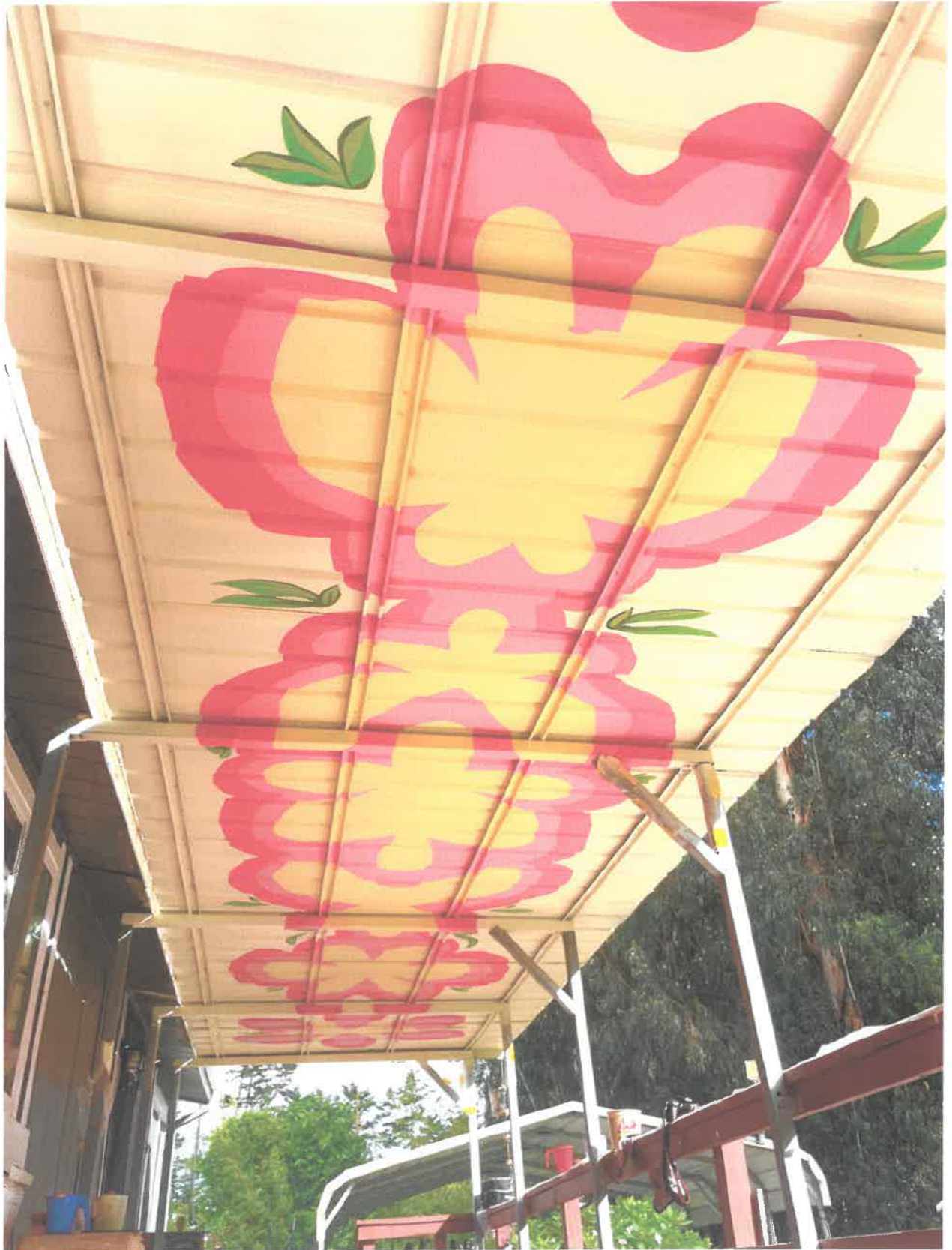
Private home, Nipomo, Ca 30 x 6 feet