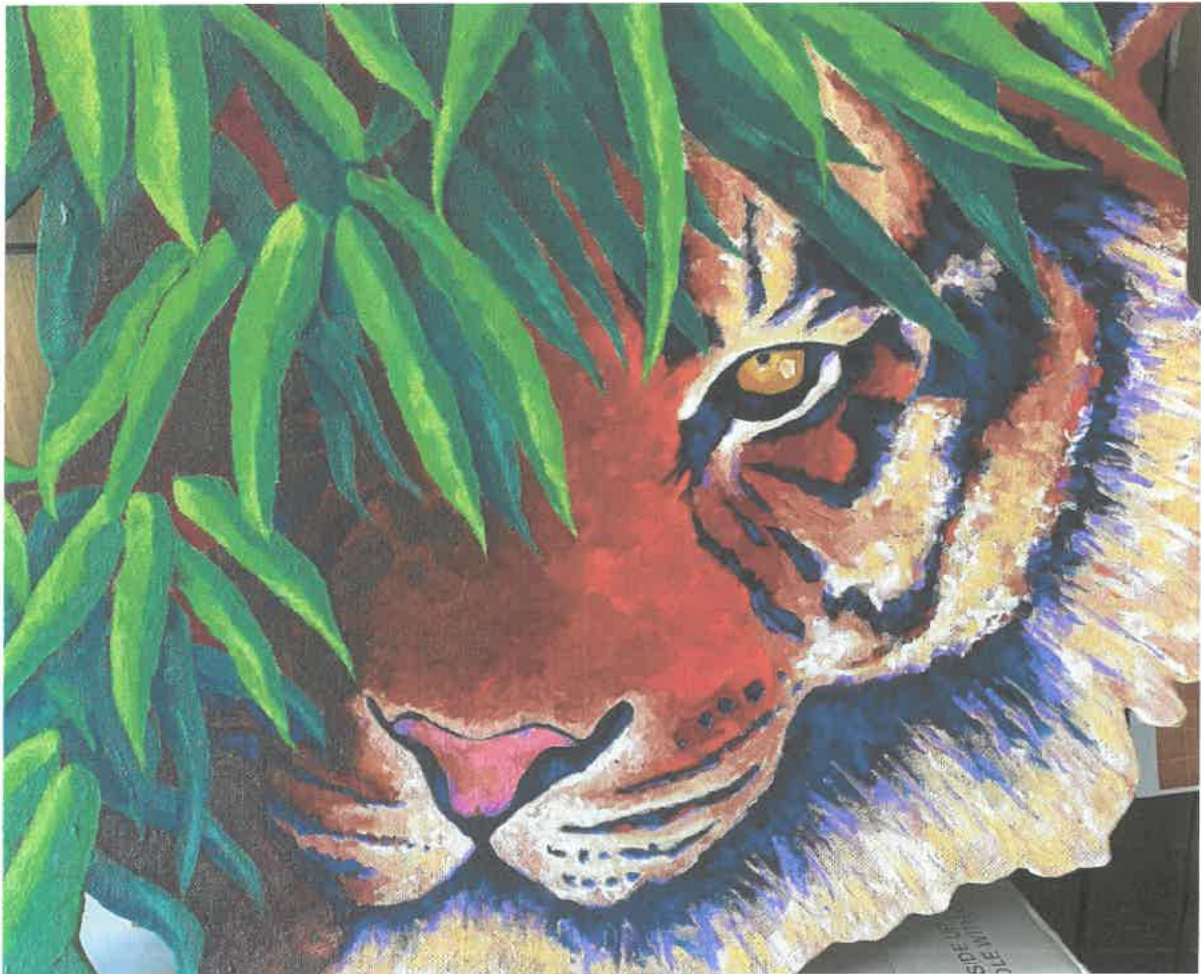
Acrylic on Board

I have been a member of the Ambiance Crew at the Live Oak Festival since 2017. This crew decorates the backstage area and Green Rooms for the musicians. This is a fundraiser for KCBX. The thought process is that since the musicians are not paid top dollar, we can give them an amazing backstage experience. Our team chooses the theme for this area and we work on the art for about six months prior to the festival. We are responsible for decorating the inside walls with colorful fabrics and adding artwork that is pleasing and unique. It is a volunteer position, and my art is not for sale at the festival. I have been successful in selling some pieces after the festival.