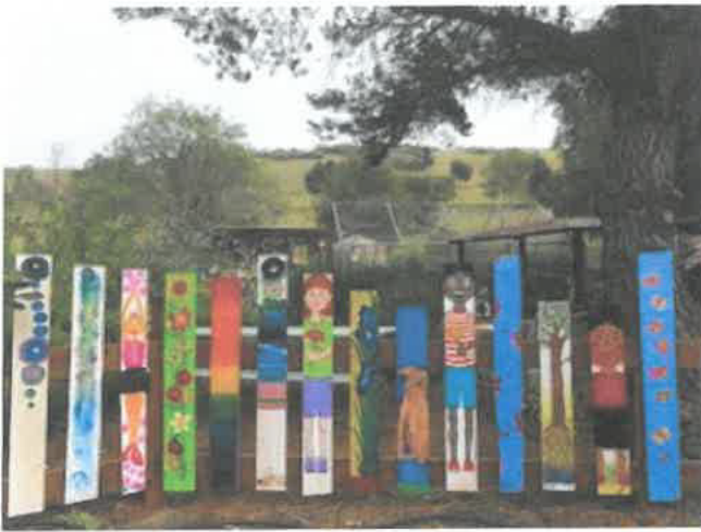
D LORD, SLO BOTANICAL GARDEN, CHILDRENS FENCE DONATION