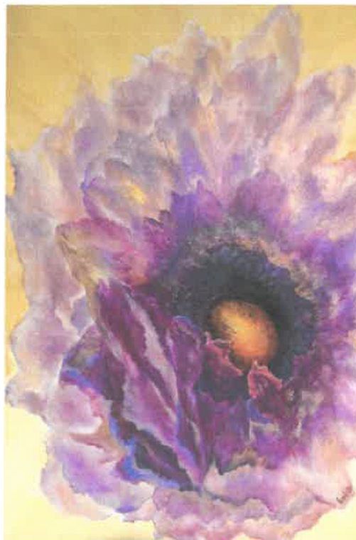
POPPY DEAR 30" X 20"

INSPIRED BY MY MEMORIES OF FALL COLOR AND EXPERIMENTING WITH TEXTURE