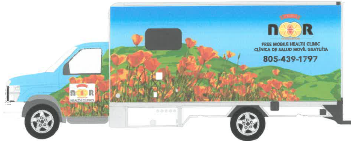
Vinyl Wrap, art rendered in Illustrator

Several months ago, I was approached by the Noor Foundation of San Luis Obispo to create a truck wrap. This vehicle is a mobile medical unit that services folks that have minimal or no health care. I was very happy to donate my time and efforts for this lengthy process.