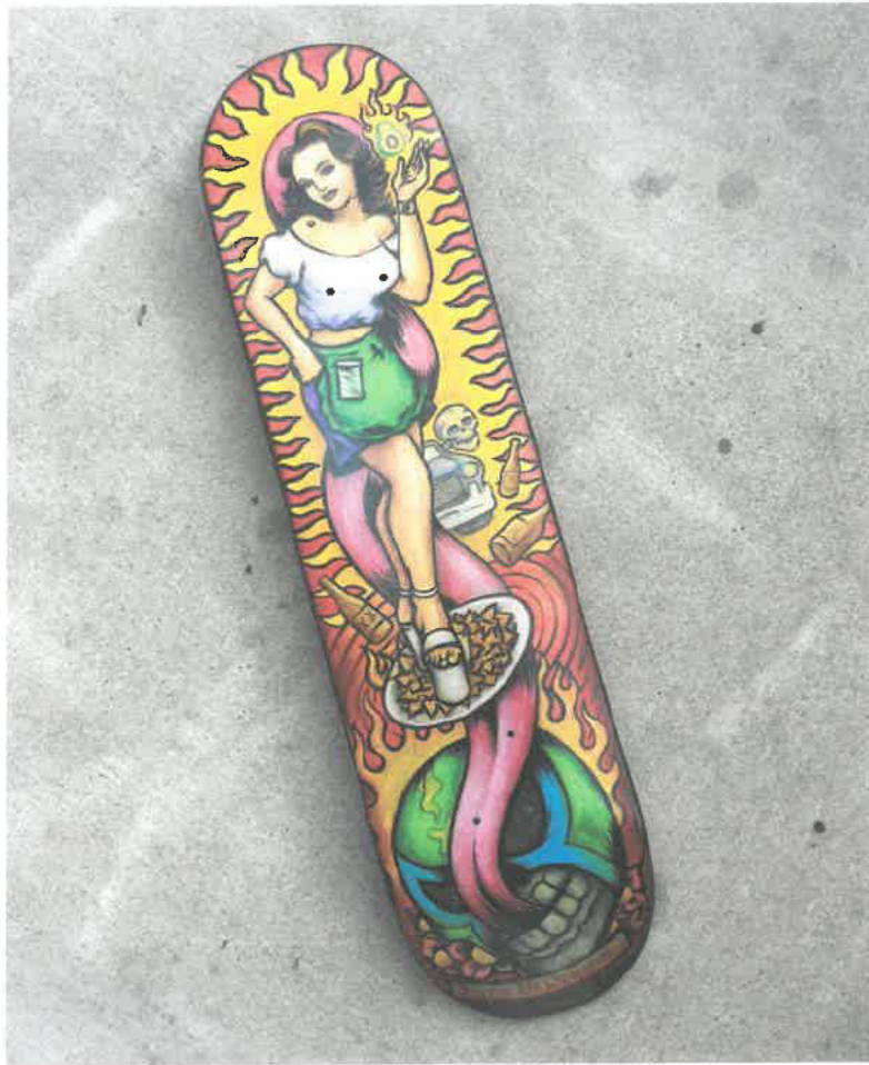
Artist name: Erik Davison Title: "Virgen de Guacamole" Medium: acrylic Date work completed: 5/22/2019 Dimensions: 8.5" x 32" skate deck