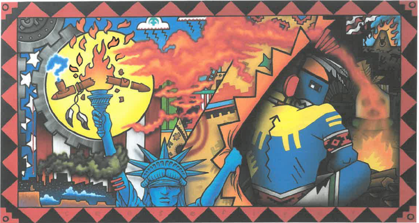
Artist name: Erik Davison Title: "Cease Fire" Medium: acrylic on panel Date work completed: 10/9/2024 Dimensions: 48" x 24"