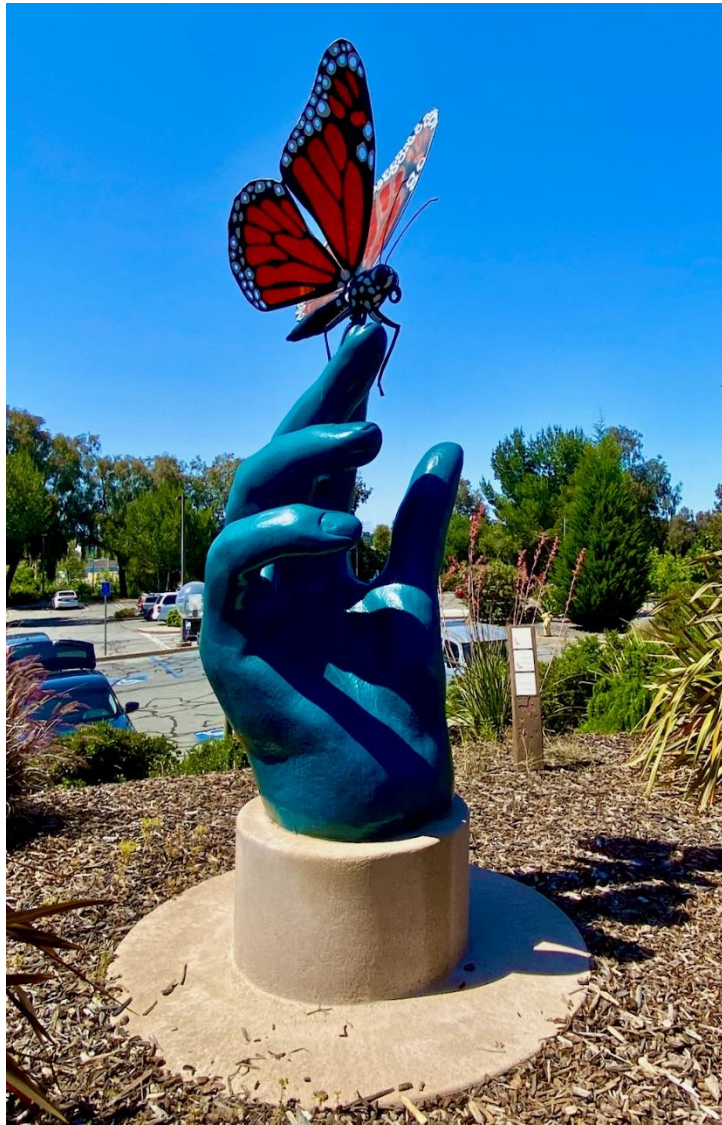
Figure 1: Butterfly and the Hand (courtesy Nan Bowman)