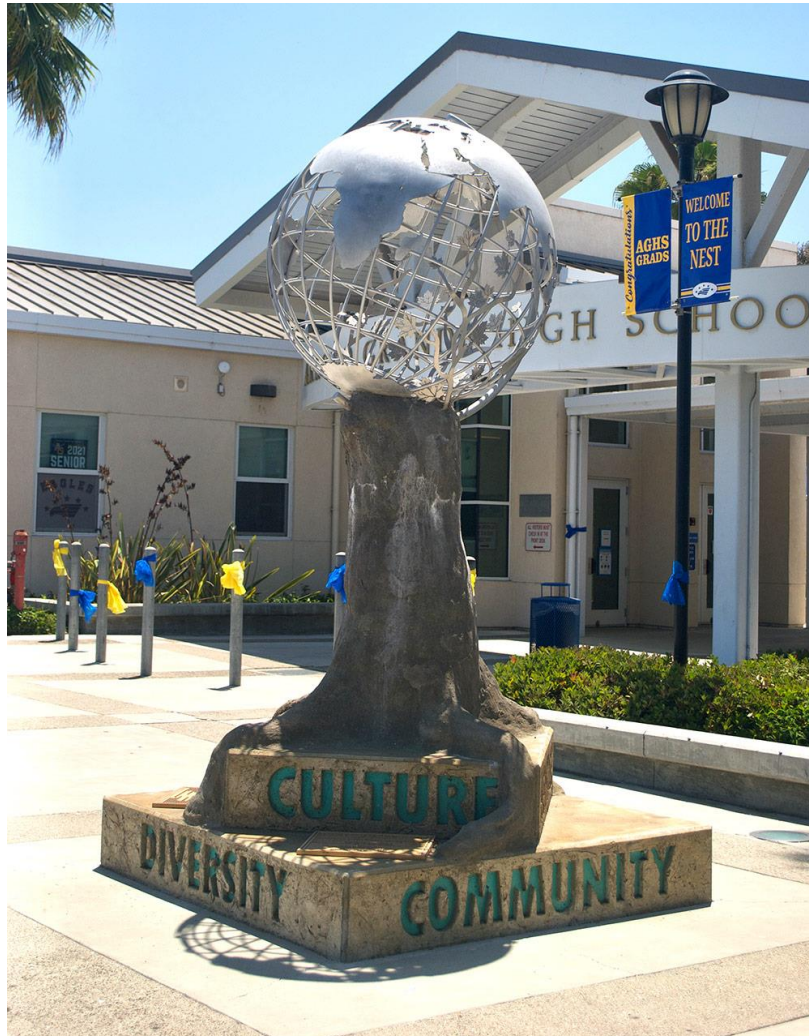
Figure 2: Diversity Sculpture