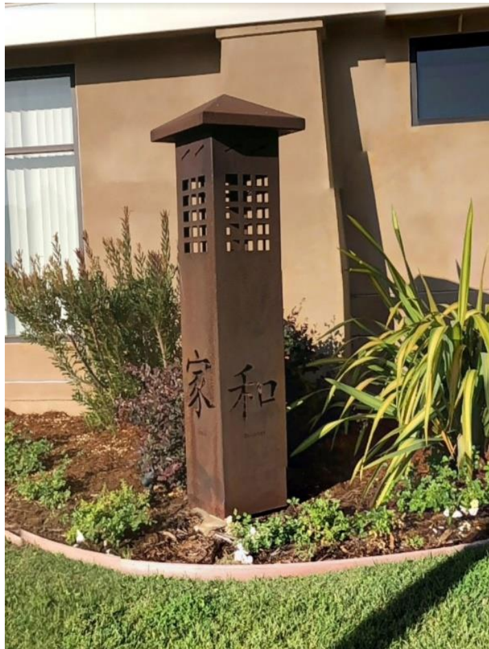
Figure 3: Japanese Lantern

Public art is allowed in all zoning districts and is strongly encouraged in the Village Core Downtown, Village Mixed Use, Gateway Mixed Use, Fair Oaks Mixed Use and Public/Quasi-Public Districts. Promotion of public art visible from intersections within these districts as well as proximate to public gathering areas, plazas and public parking areas is highly recommended.