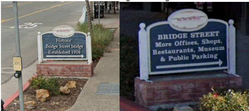
Figure 4: Bridge Street Sign

The wooden community center signs on Branch Street in front of Bank of America and on the other side of the road have been removed. The “no-u turn” signs on Branch Street on either side of the former Short Street have been removed with permission from police staff. Redundant signs at the north end of the Car Corral have been removed. Signs at parking lot entrances are being evaluated on an individual basis to determine which are still needed.