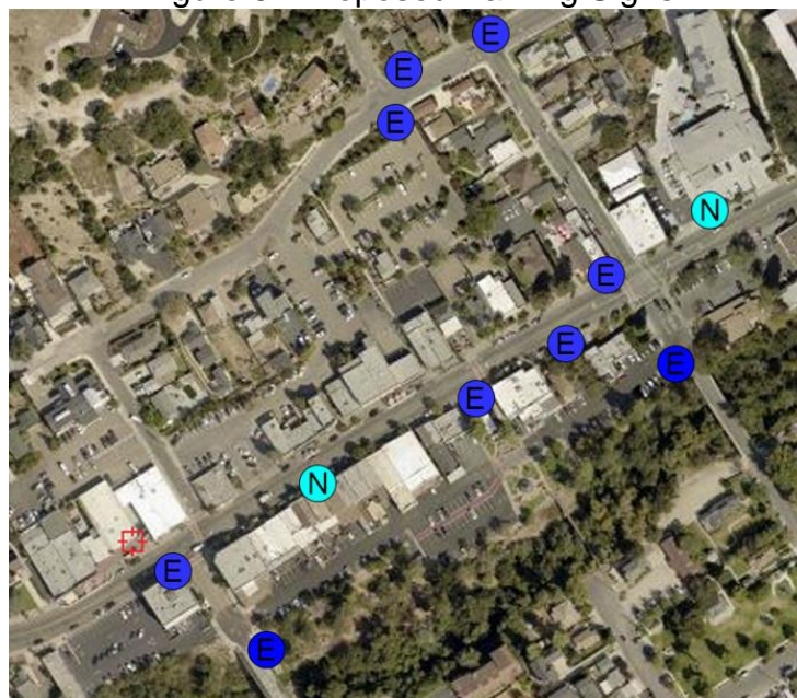
Figure 5: Proposed Parking Signs

See Figure 5 for the location of all proposed parking signs.